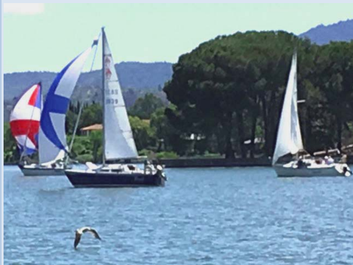
Fish jumping off Buckingham Point