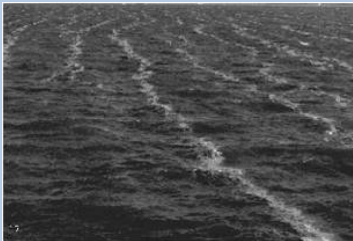
"foamy streaks" seen at the water's surface